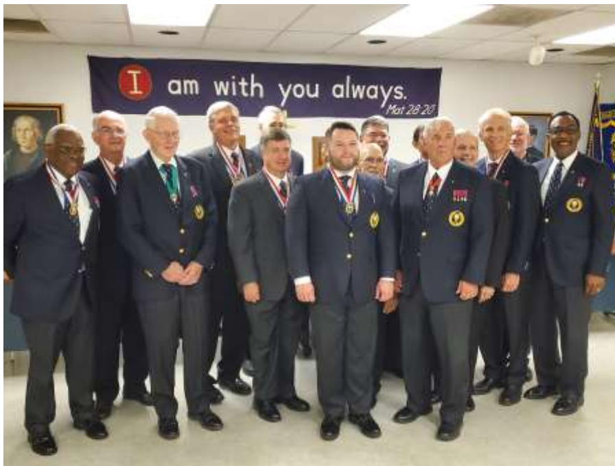
Potomac Assembly New Officers for 2022—2023