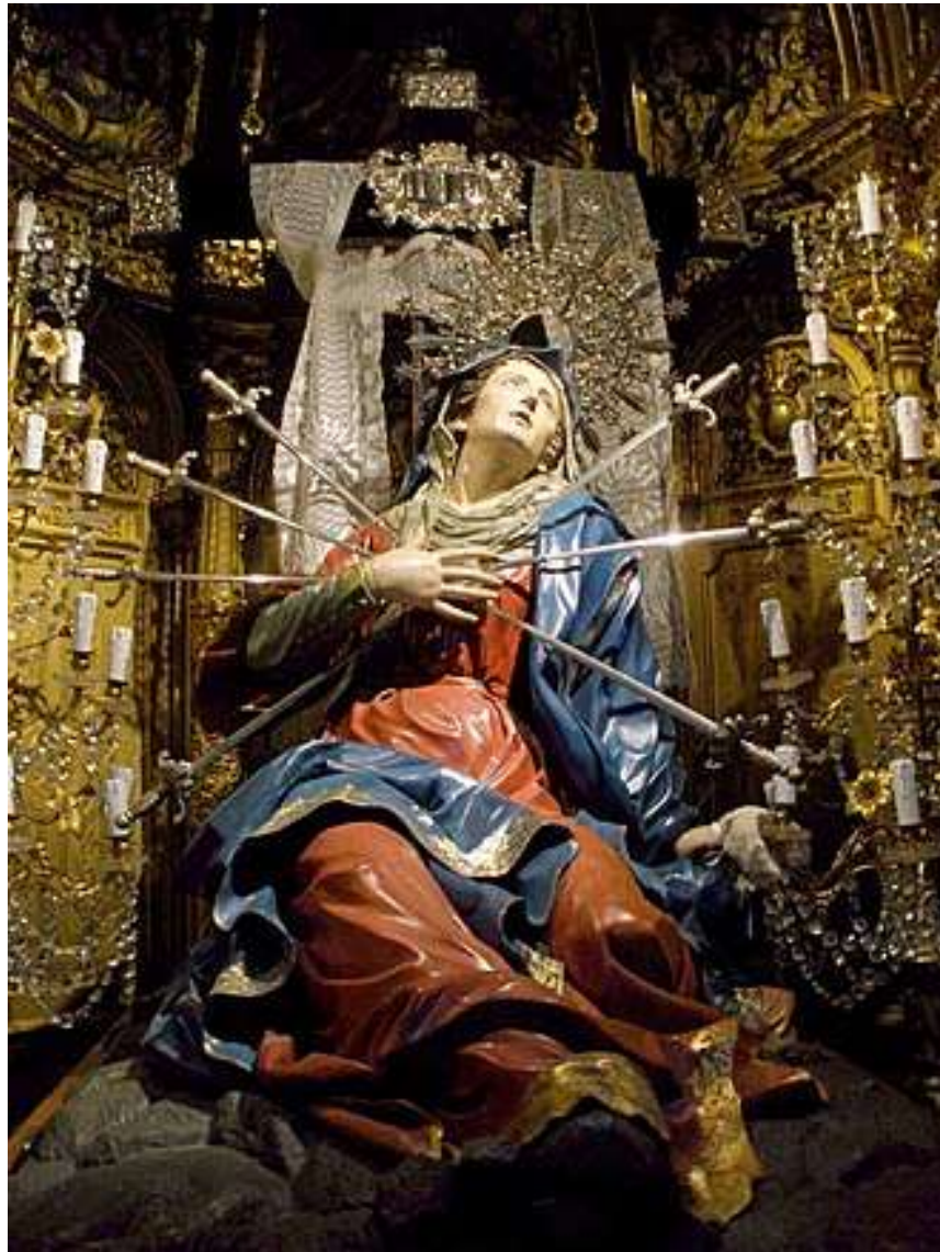
Seven Swords Piercing the Sorrowful Heart of Mary in the Church of the Holy Cross, Salamanca , Spain