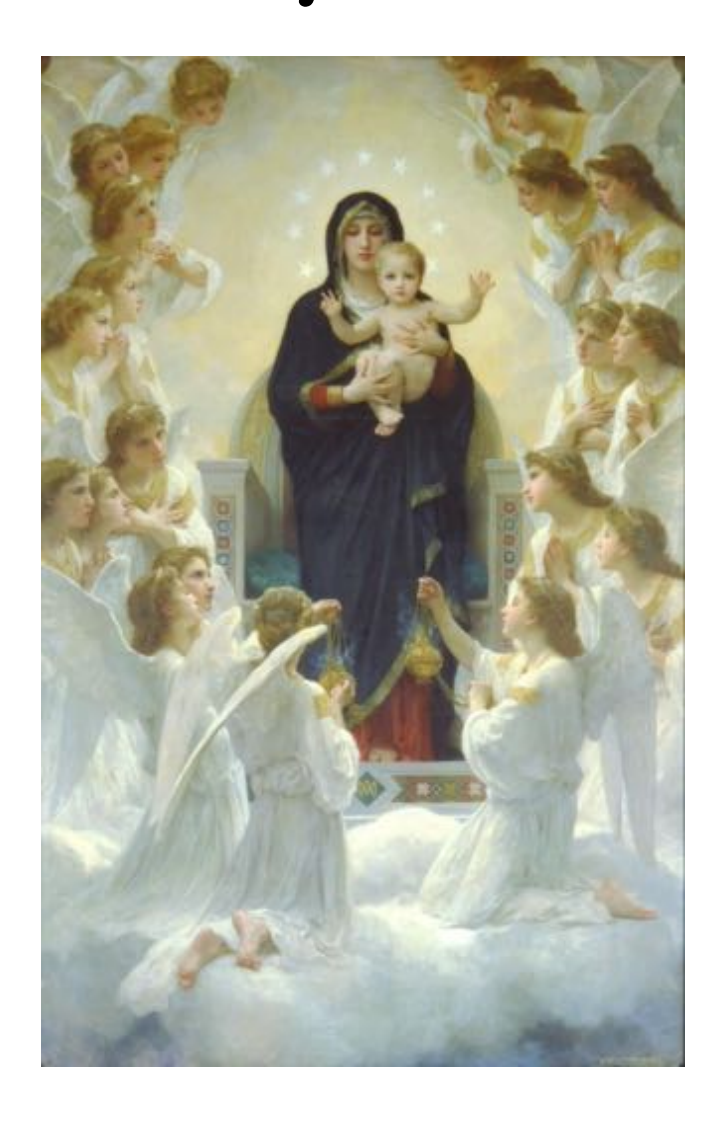
The Blessed Virgin Mary