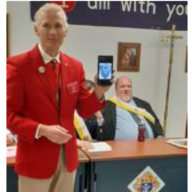
Two New candidates from Springfield Council