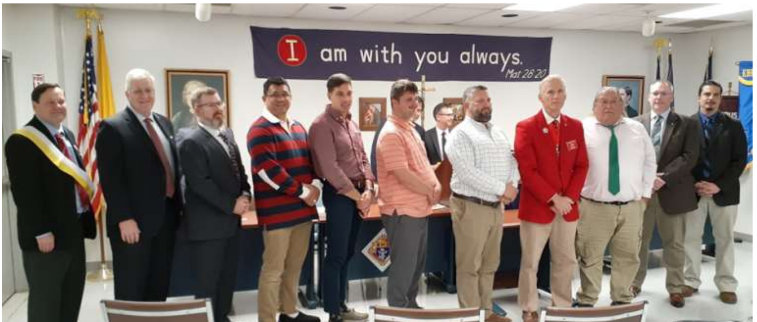
Seven New Candidates for Mt Vernon Council 5998